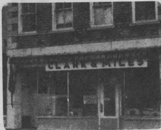
184 Front Street First recorded location, 1846