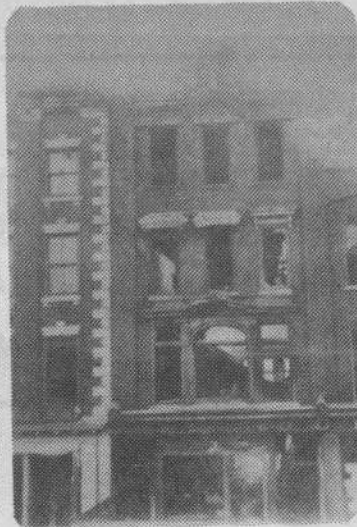
302 Front Street