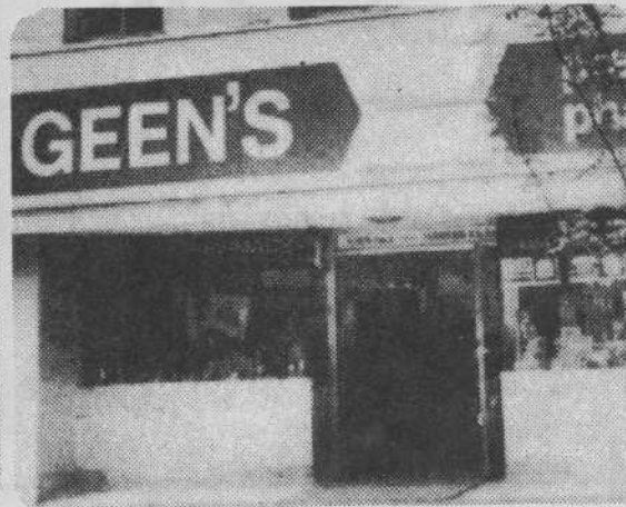
276 Front Street Present location, since 1941