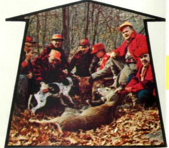
The Belleville area offers excellent hunting