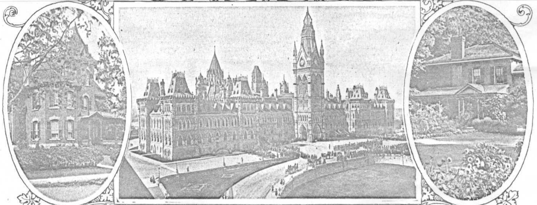
In Belleville: The home of a well-known Bank Manager.