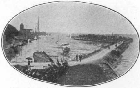
Belleville Harbor and Queen Victoria Park.