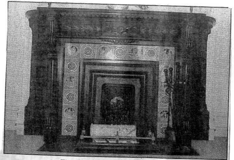
The fireplace in the living room.

and there is a third, more utilitarian, brick fireplace in a back room.