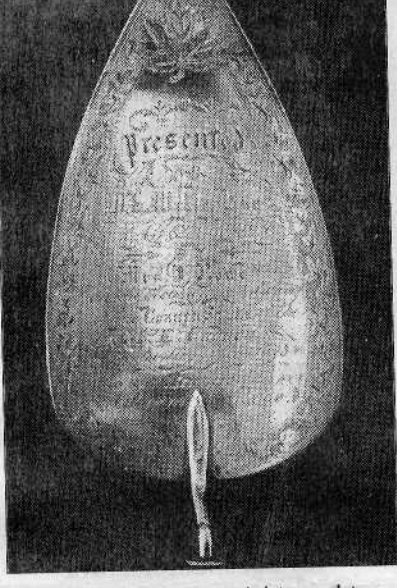
This is the ceremonial trowel to

The end came for this church barely two decades after it