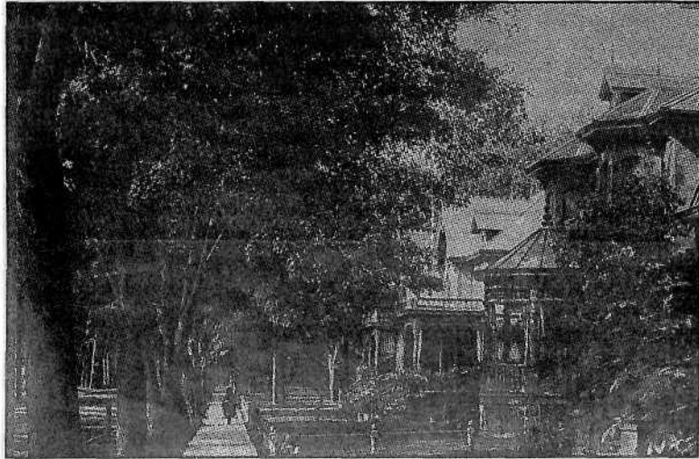
Hastings County Historical Society