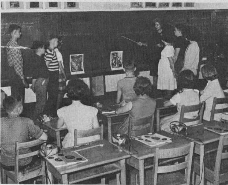
Small classrooms encourage individual attention from teacher.