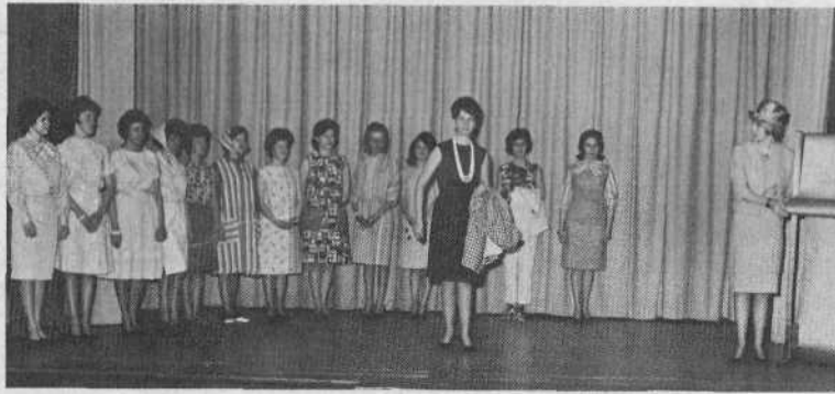
Students model their own attractive creations.