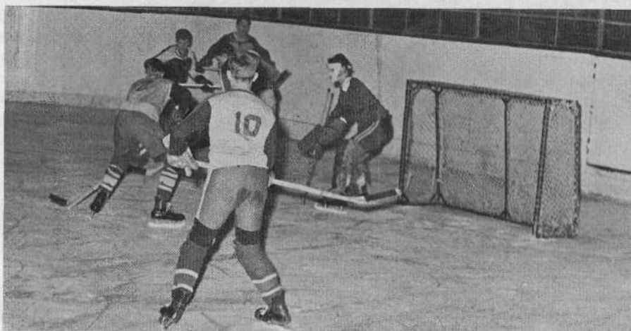
Enthusiastic students take part in the fast game of hockey.