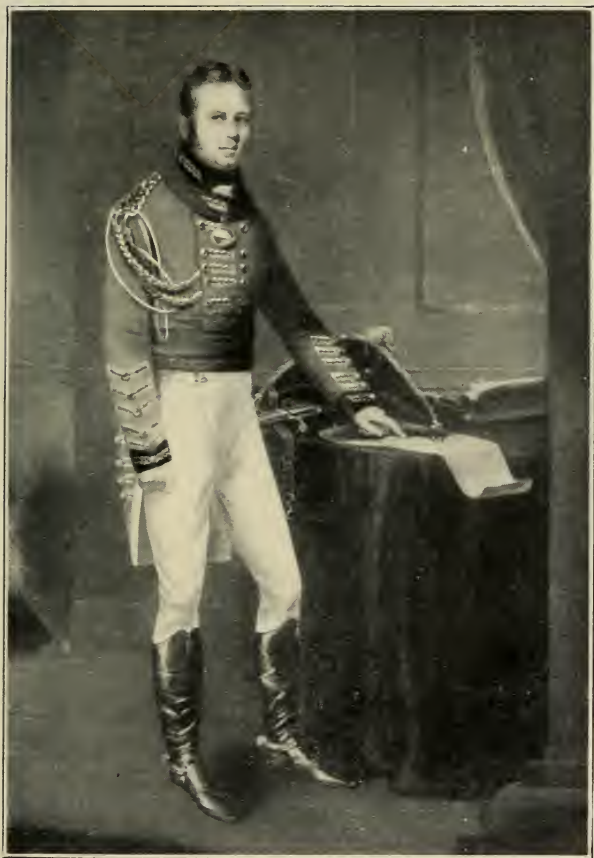
SIR GEORGE PREVOST