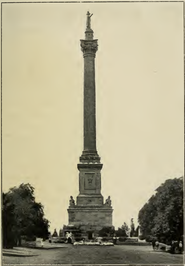
BROCK'S MONUMENT ON QUEENSTON HEIGHTS