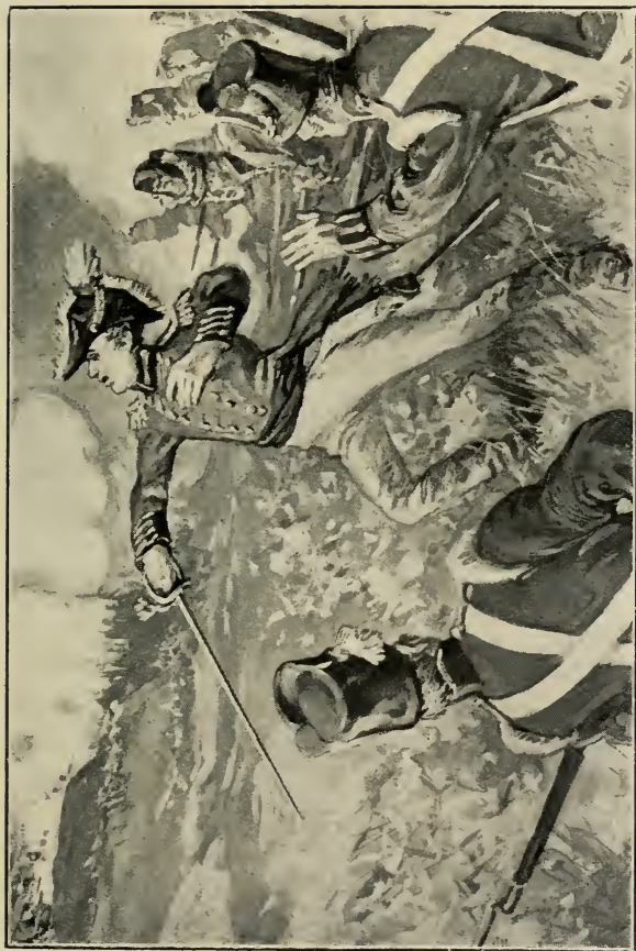
THE DEATH OF BROCK