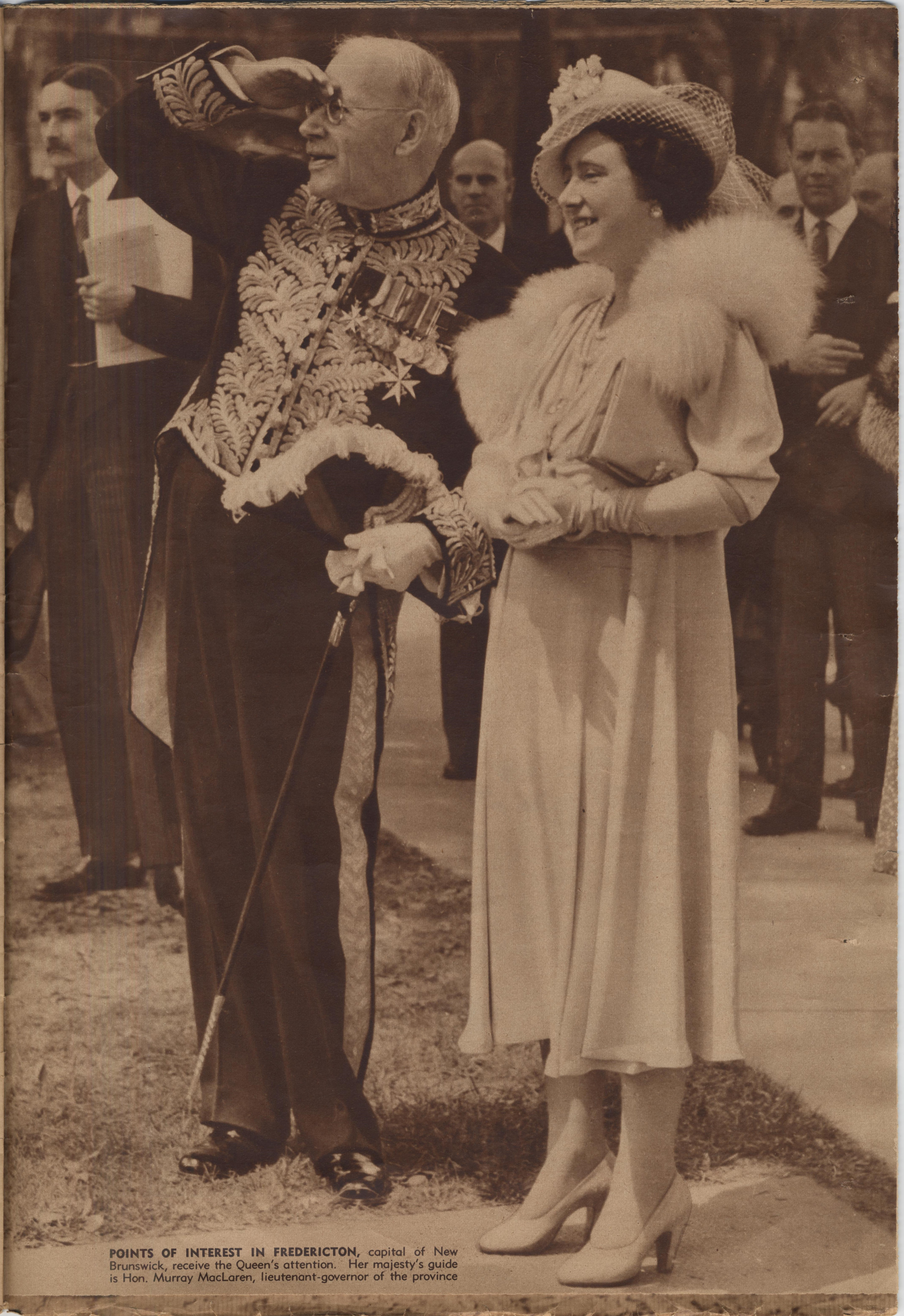
POINTS OF INTEREST IN FREDERICTON , capital of New Brunswick, receive the Queen's attention. Her majesty's guide is Hon. Murray MacLaren, lieutenant-governor of the province