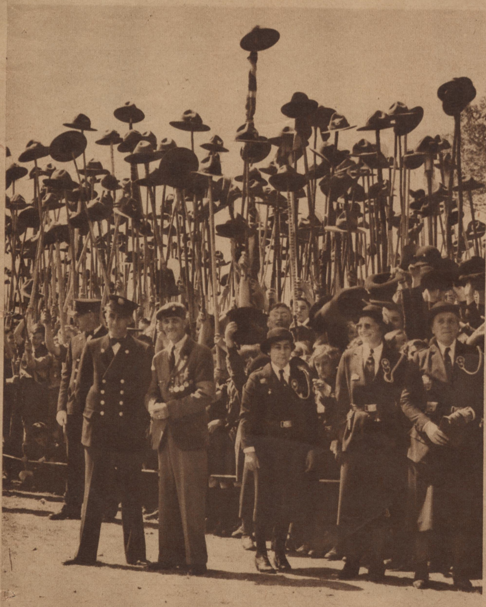
HATS HELD HIGH ALOFT on their poles, boy scouts at Halifax present an unusual sight as they bid the King and Queen "bon voyage"

at Fredericton. Special trains brought Maritimers from near and far to see their majesties as the tour drew near its close