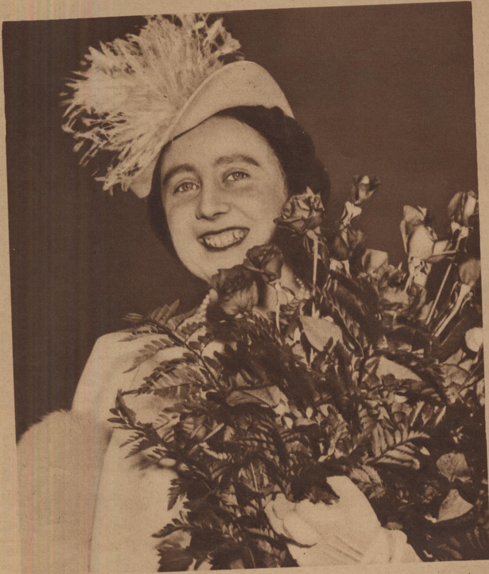
THE KING AND QUEEN had a "preview" of the great welcome that awaited them in Washington and New York when the royal train paused briefly at Baltimore. The Queen received a bunch of "American Beauties"