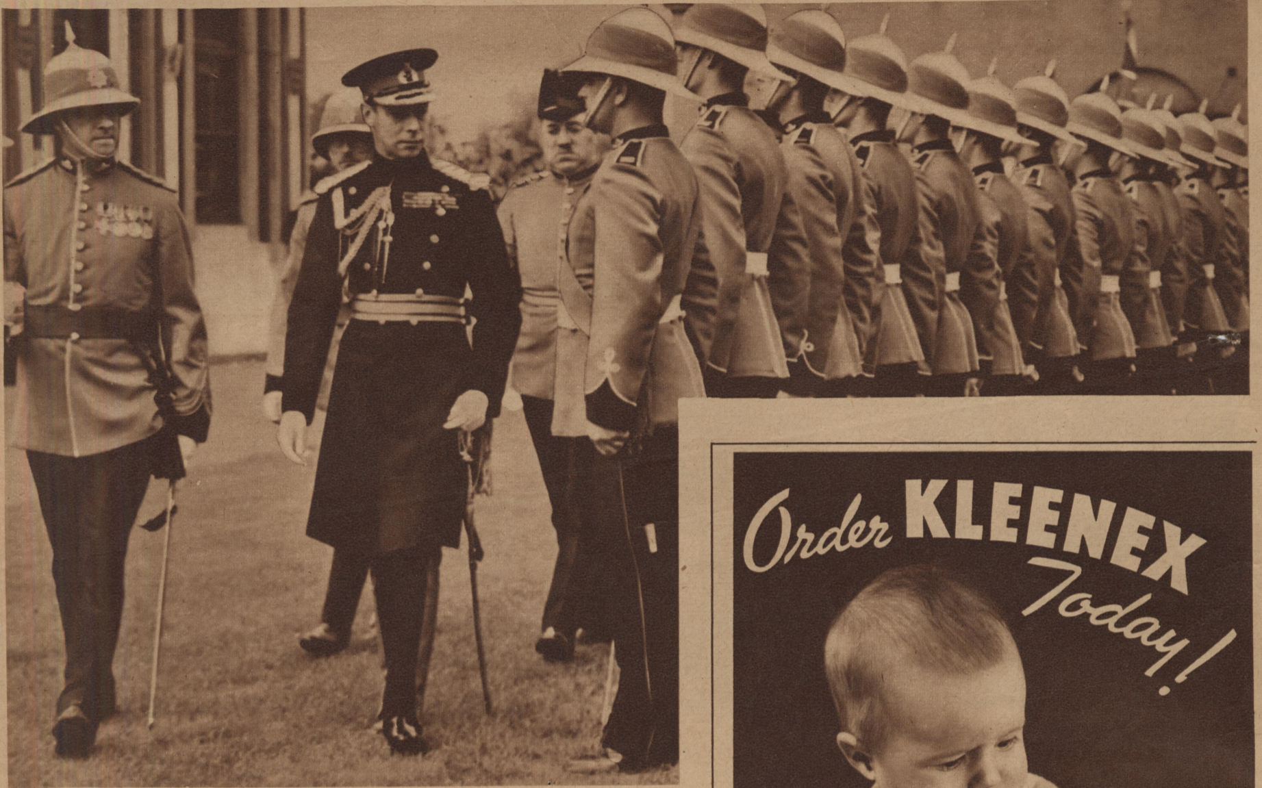
FROM LONDON, ENGLAND, to London, Ont., travelled the King and Queen, and the photograph above was taken in the latter city. It shows his majesty inspecting a guard of honor formed by the Royal Canadian Regiment