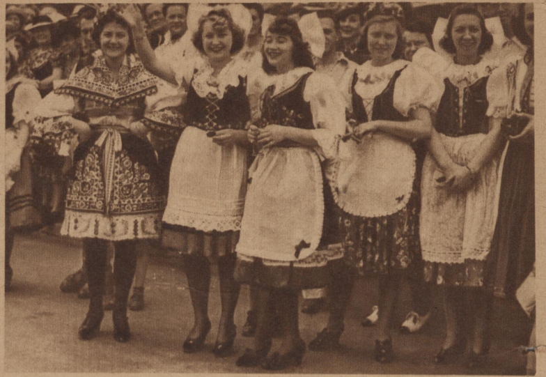
ROYALTY LITERALLY "stopped the show" at the fair, as gaily dressed workers came out to see them go by