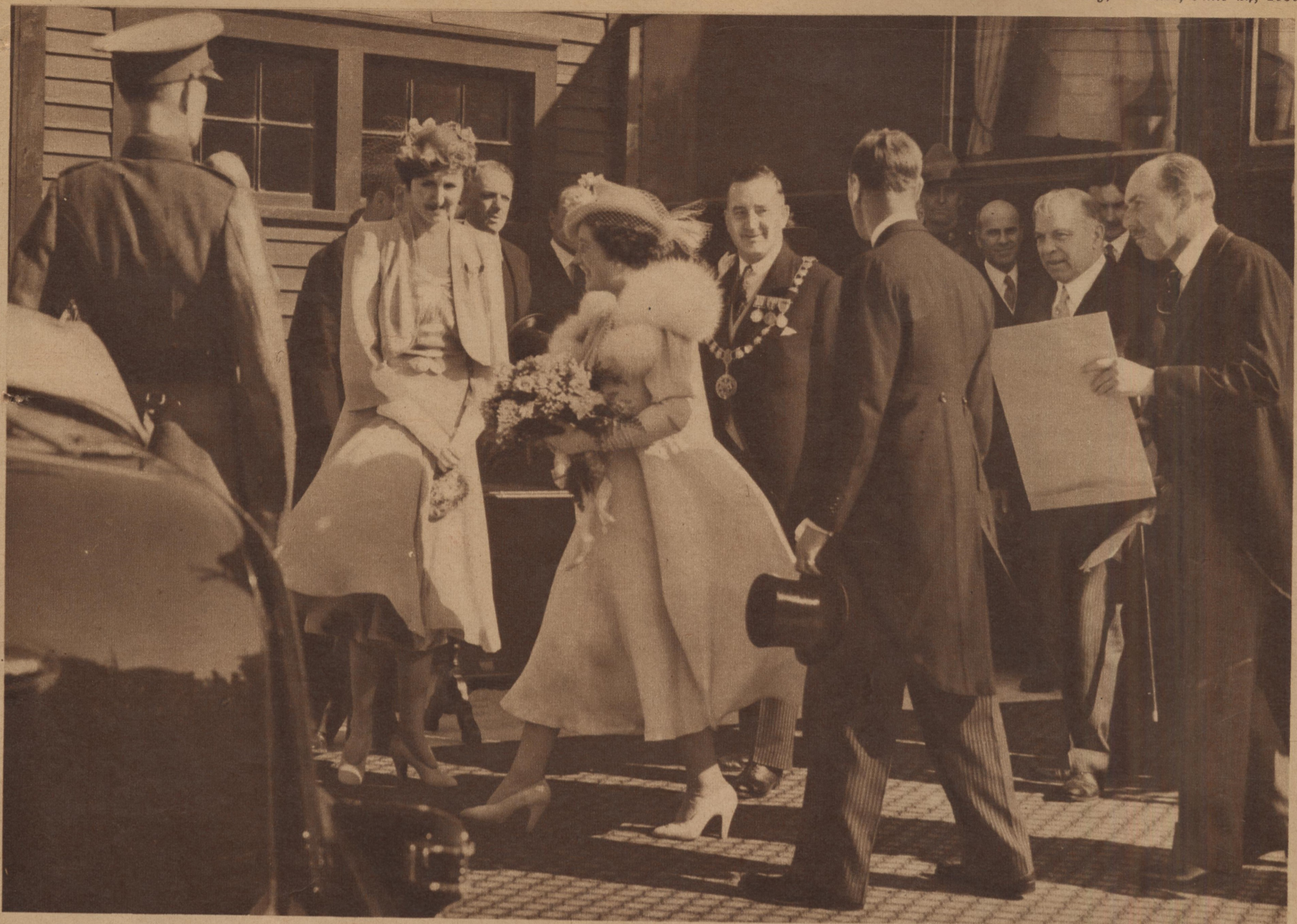
AFTER A 180-MILE TRIP by car through New Brunswick's unspoiled scenery, the King and Queen arrived, fresh and smiling,

at Fredericton. Special trains brought Maritimers from near and far to see their majesties as the tour drew near its close