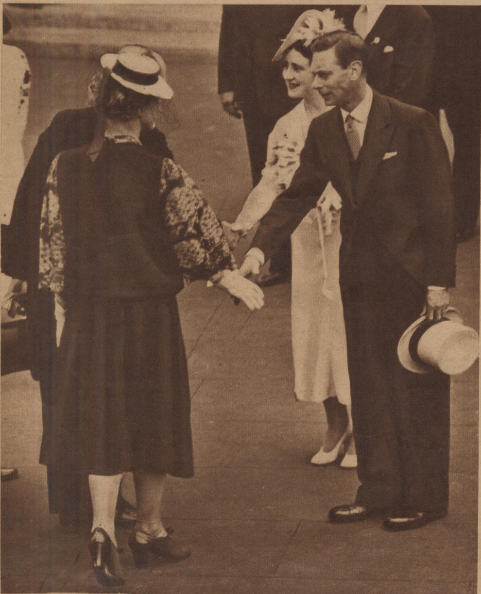
THEIR MAJESTIES' CHARM made them literally "the toast of New York" when they visited the biggest city of the new world and toured the world's fair. Above they are seen shaking hands with well-wishers on the fair grounds