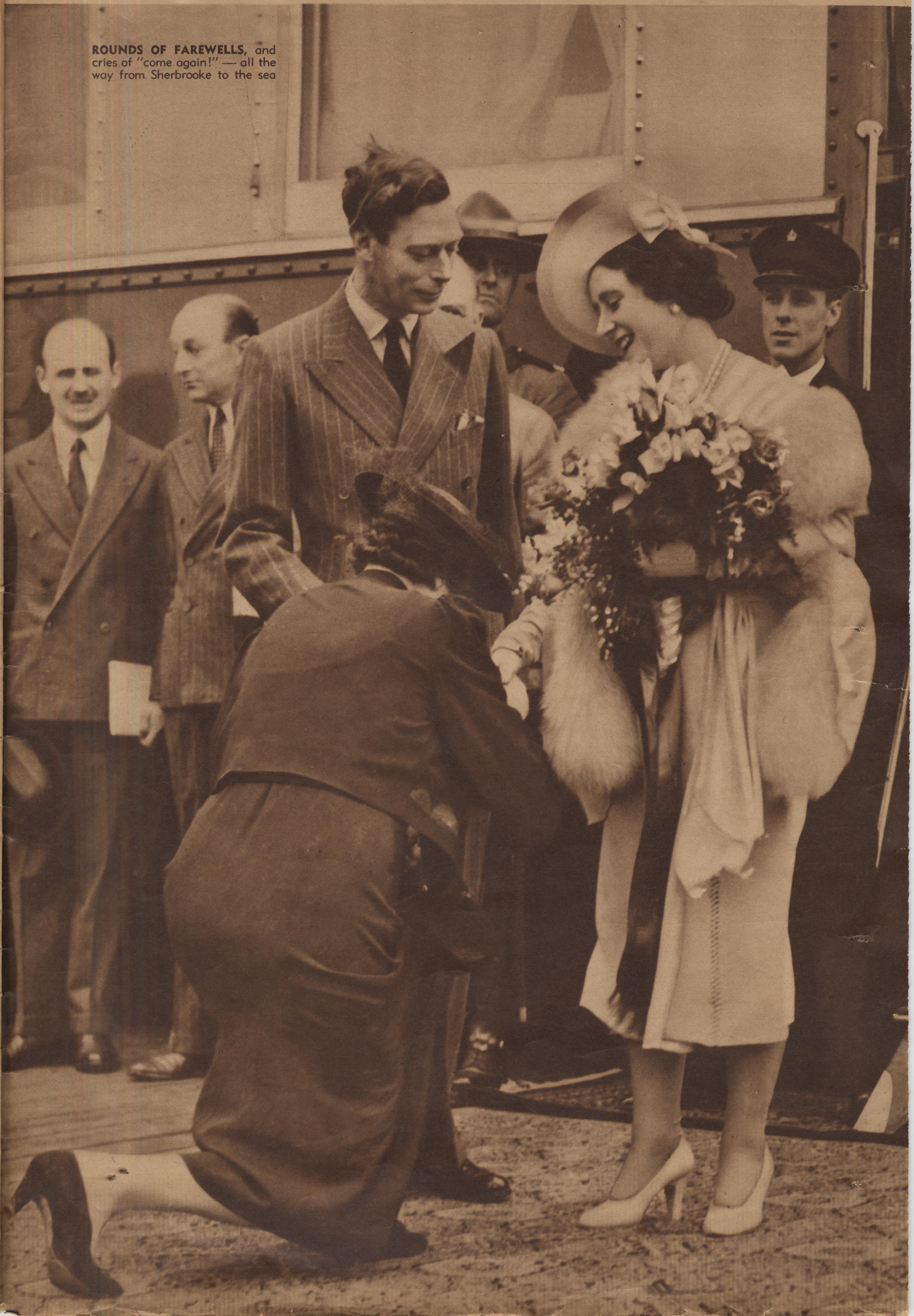
ROUNDS OF FAREWELLS, and cries of "come again!" — all the way from Sherbrooke to the sea