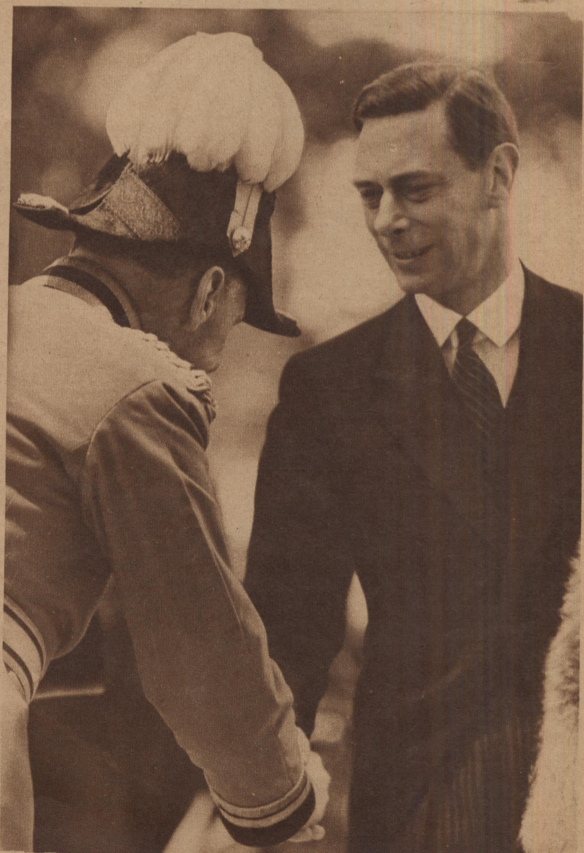
CHARACTERISTIC of the King's last day in Canada is this picture, one of many warm "good-bys" to Canadians