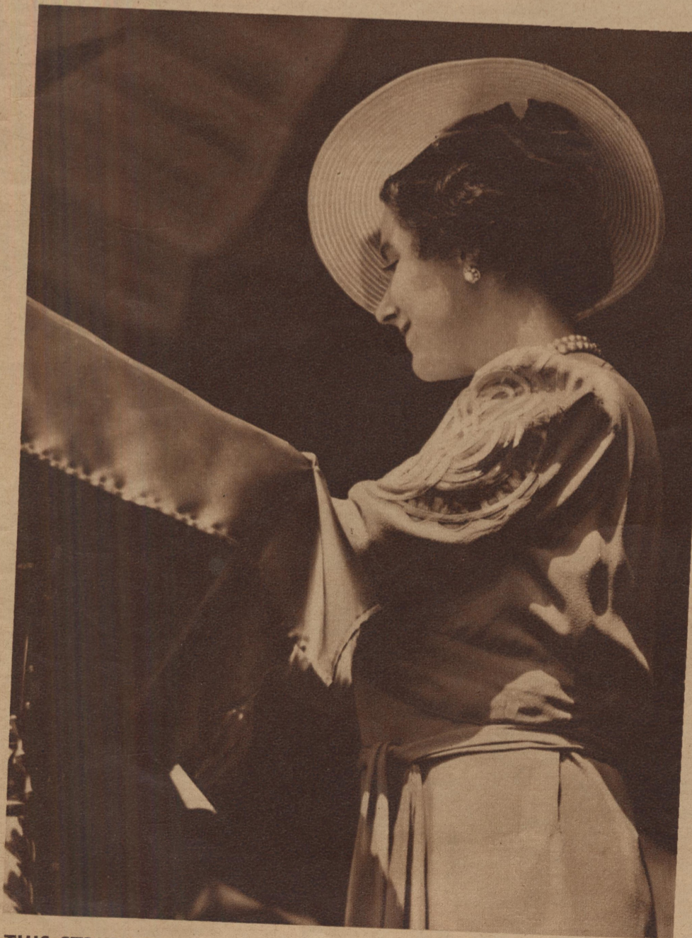
THIS STRIKING PICTURE of the Queen, smartly gowned and wearing a tilted hat of white straw, shows her majesty as she signed the register at Hamilton, during an eventful trip through towns and cities of western Ontario