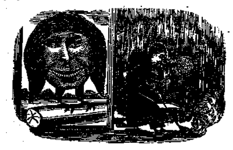
FLYING HEAD AND WOMAN SITTING BY THE FIRE.

I will now relate a few of the monsters that plagued them: The first enemy that appeared to question their power or disturb their peace was the fearful phenomenon of Ko-nea-rah-yah-neh, or the flying heads. The heads were enveloped in beard and hair, flaming like fire; they were of monstrous size, and shot through the air with the speed of meteors. Human power was not adequate to cope with them. The priests pronounced them a flowing power of some mysterious influence, and it remained with the priests alone to expel them by their magic power.