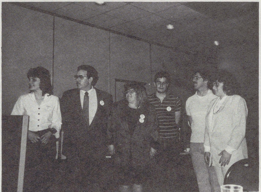
Student Senate Members Recieve Recongition