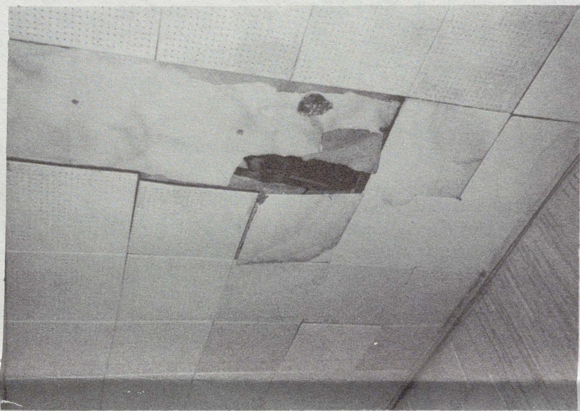
Cafeteria and Food Service Upgrade cost: $55,000