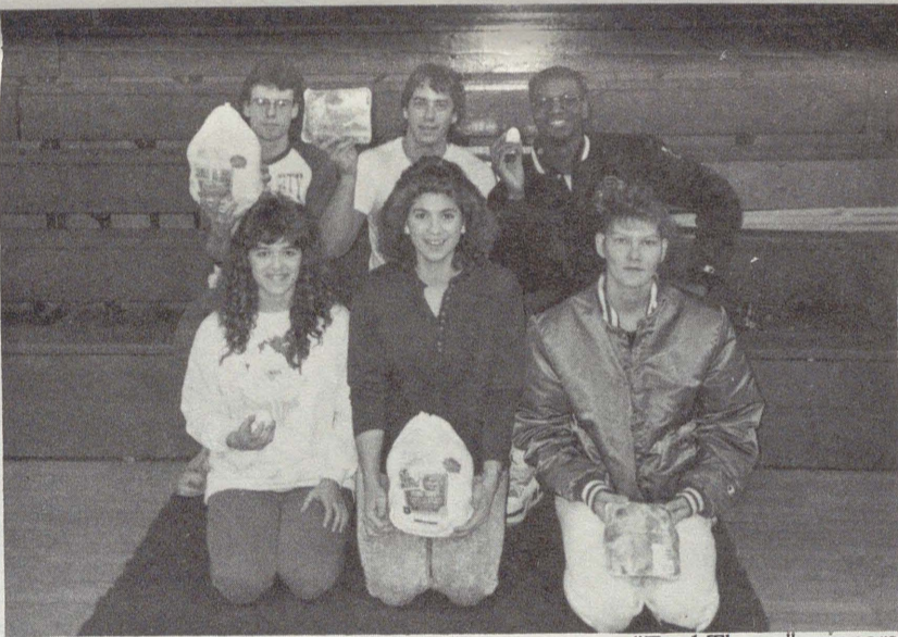
"Foul Throw" winners

A total of 42 brave men and women truned out, on the two announced evenings, at the EAC gym to try their luck at 20 free throw shots, in hopes of winning a Thanksgiving day turkey.