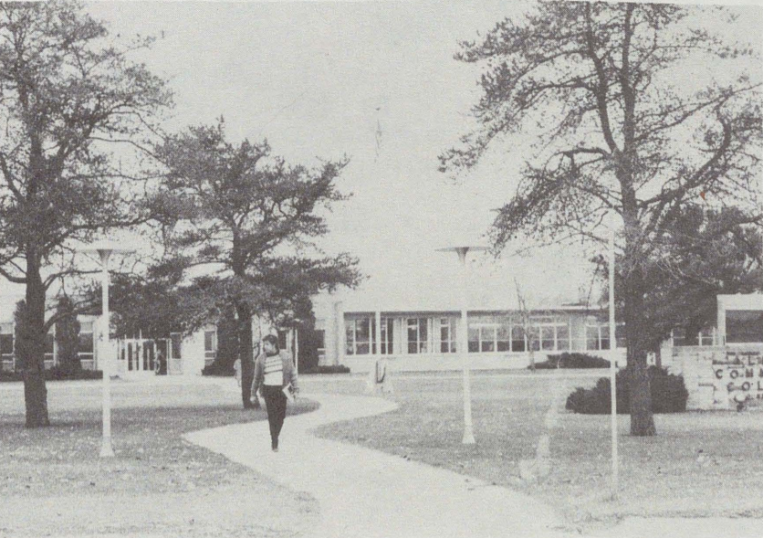
Van Lare Hall

Since there are 2,275 students this year, ACC will need all of the programs, services and staff. So, raising tuition was the most sensible answer to better the