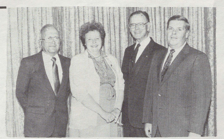
NCA Consultant Team

The team's perspective of the college proved to be benefical to the teams recommendation of a ten year accreditation. They were able to assess ACC's strenghts along with how well we are improving