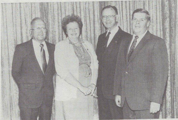
North Central Accreditation Team