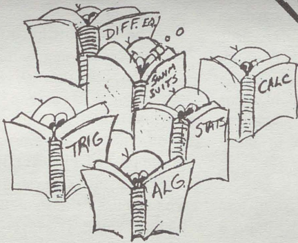
Some math students exhibit a greater passion for curves and figures.