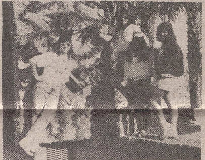
The Concrete Club took first place in the can competition. Wouldn't you know?