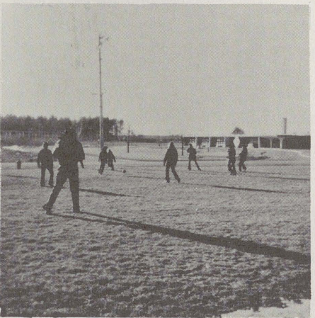
Spring is just around the corner?