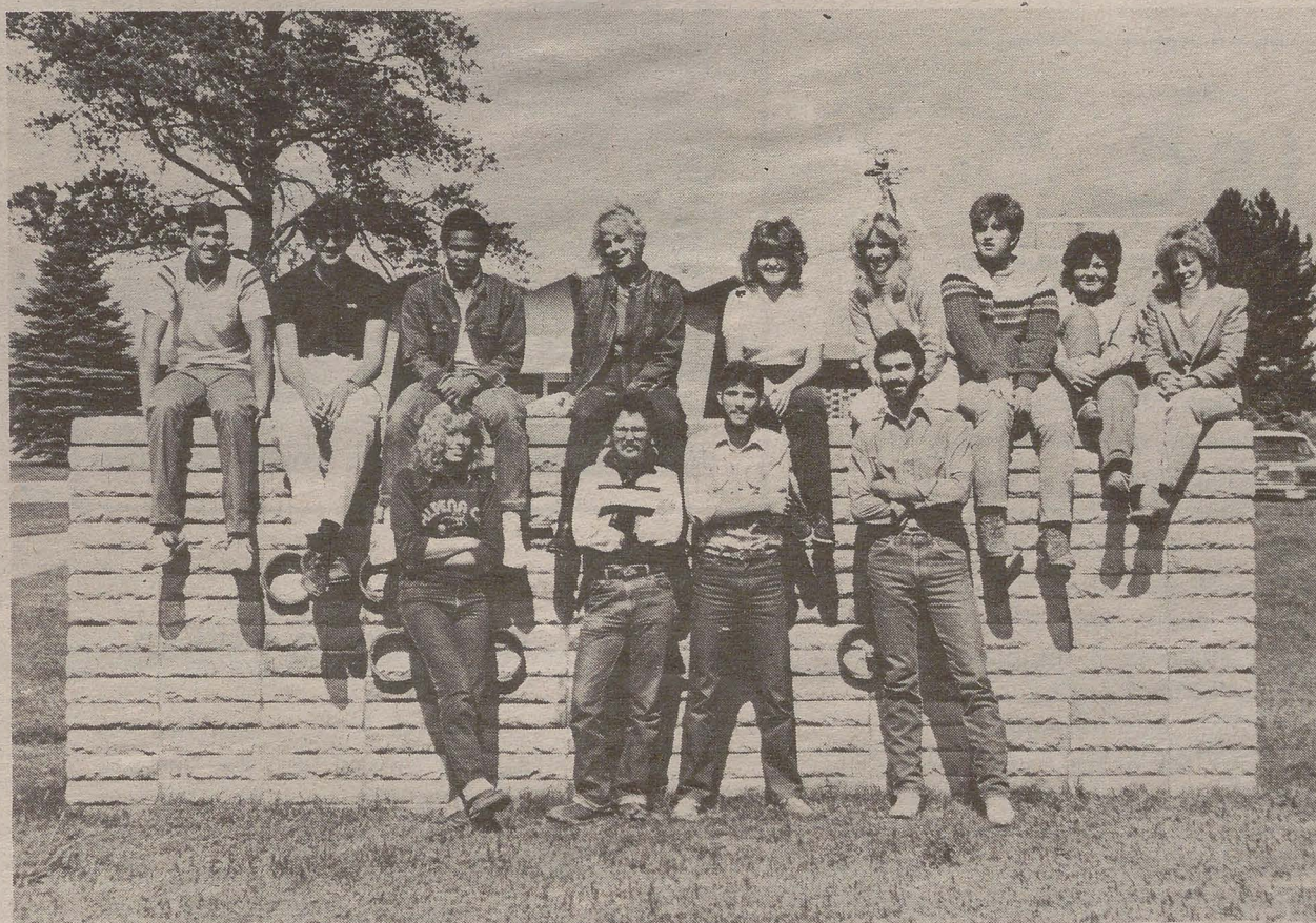
1983-84 Campus Update Staff

The Student Affairs Office can be found in the lobby of Besser Tech. The phone number is 356-9021 Ex. 240.