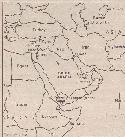
WORLD BOOK map

Striving for better English usage, Al-yousef, a sophomore, finds some classes more difficult because of the language. To aid him in translation he uses an Arabic/English dictionary.