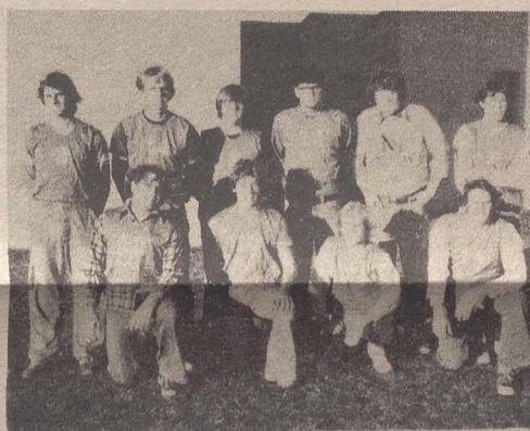
Runner-ups: Team Number Six