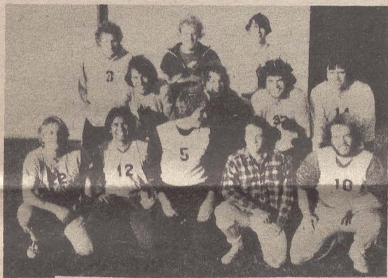
The Champs: Good Old Buds

Dec. 22, 23: Thunder Bay Classic for women.