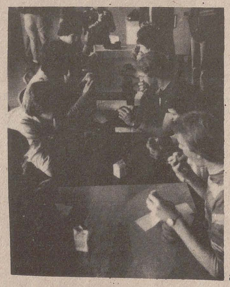
'Muf ahhh gurr waaa noumbua'