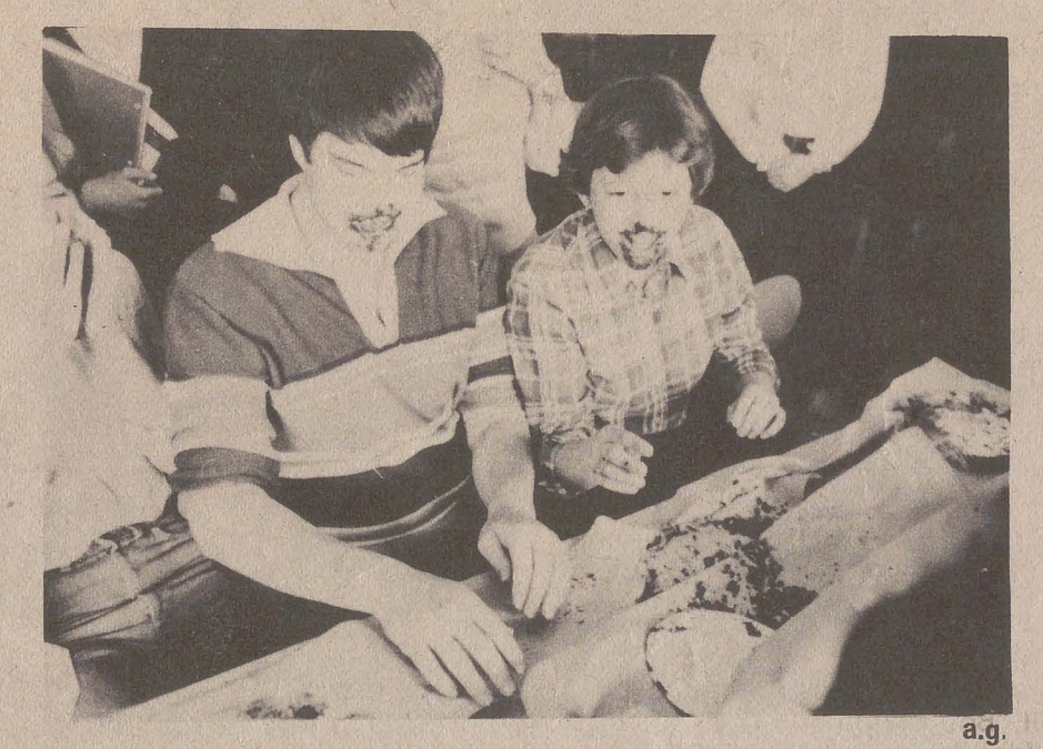
What a way to go.