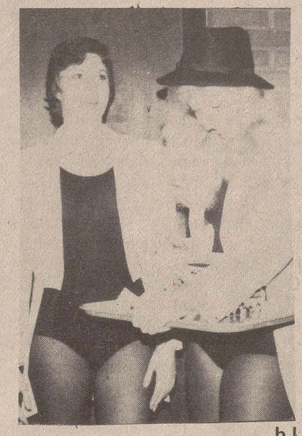
50 for you and 50 for me

There was a small egg fight after the egg toss. Many hits were scored, but no one was killed, although there were a few shattered egos.