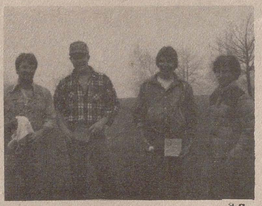
'We won? No man we won!

The egg toss was held in the back of VLH on the 23rd of April Theta Kappa. For first place, there was a tie.