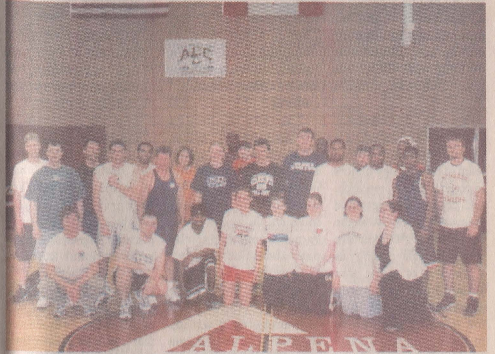
The people who took part in the game.