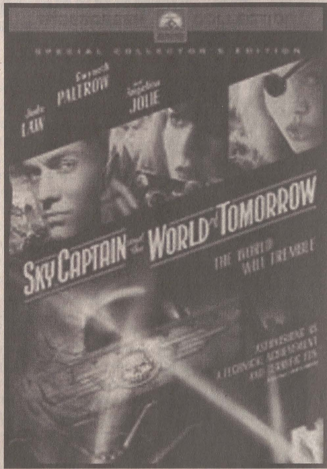
Sky Captain And The World Of Tomorrow.

Reaching the end of their trip, Polly tries to conserve her one remaining exposure by passing up spectacular scenes, knowing she can find a better one. Finally, she raises her camera and shoots the perfect photo