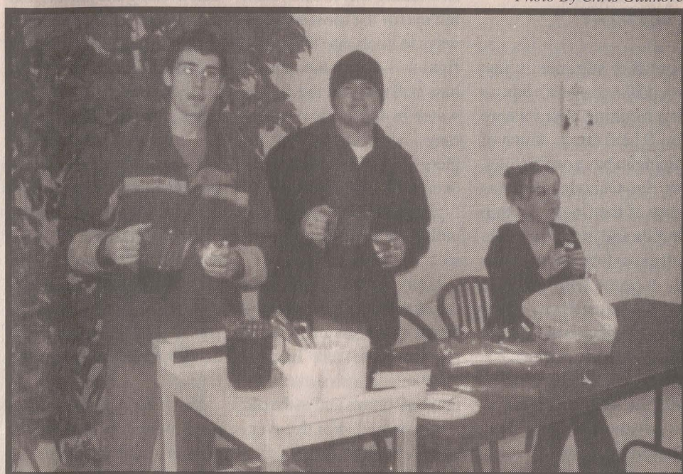
Student Senate serves up rootbeer floats.

more fundraisers this spring; a car wash is one idea that has been talked about by members of the group.