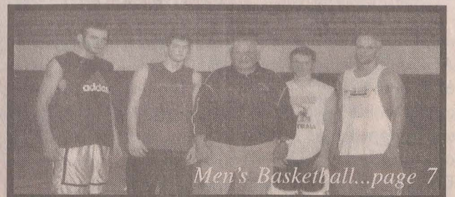
Men's Basketball...page 7