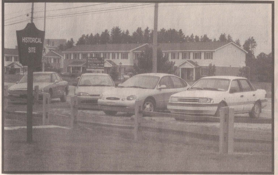
Illegally parked cars just waiting for a ticket.

He also advised that the school is unlikely to add more parking at Van Lare Hall as long as the big lot across the street is never full.