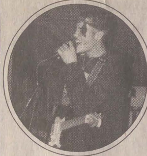
United We Dance Page 8