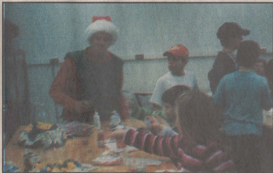
A Little Help from the Elves

By November 26, about 6,300 Angels of Hope, each with an accompanying inscription, will have been sent to the victims' families, rescue workers and others directly affected. Distribution of the Angels is being handled by a variety of relief agencies including the New York City Family Assistance Center, the Salvation Army, New York City Police Department, Catholic Charities, and the Cantor-Fitzgerald Fund.