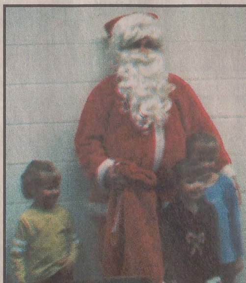
Santa Visits ACC

The Annual Christmas Caper was held Tuesday, Nov. 27. The event was a huge success with activities ranging from decorating, arts and crafts for kids, and "Christmas Treats" served by the Lumberjack Shack.