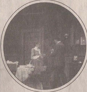
Angel Street Page 11