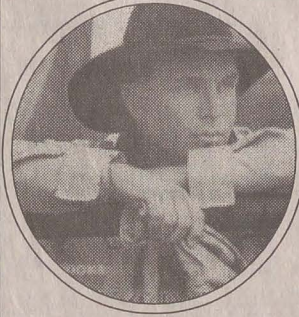
Brooks, Staind, Carlin Meet Page 15