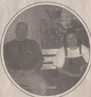
ACC, Pied Piper Team-Up Page 2