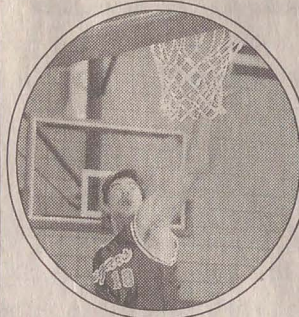
Lumberjack Dec Showdowns Page 9