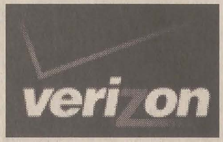
Logo off Verizon.com