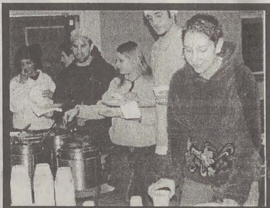
Waiting in line is never as fun!!

Student Support Services (SSS) put on a West African buffet dinner on March 1st. The free dinner included: Nigerian Peanut soup Jollof rice Shoko (beef & spinach stew) West African Groundnut stew Coconut pie