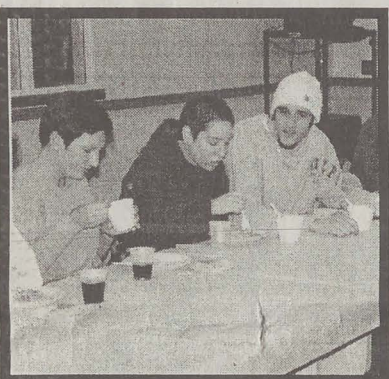
Students enjoy an array of ethnic food...

Student Support Services (SSS) put on a West African buffet dinner on March 1st. The free dinner included: Nigerian Peanut soup Jollof rice Shoko (beef & spinach stew) West African Groundnut stew Coconut pie