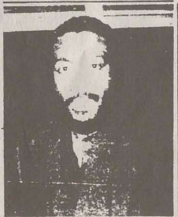
GREGORY ATTACKS MORAL POLLUTION

...polluted many of the 500 who heard Dick Gregory on February 13, went to hear him speak about the moral pollution in America today. He said that the moral pollution is not just a black problem, but a white problem that involves every American. Dick Gregory spoke of black against white, but he spoke against them. By attacking the moral pollution, he is pointing out the moral pollution in America. He said that the moral pollution is not just a black problem, but a white problem that involves every American. He said that the moral pollution is not just a black problem, but a white problem that involves every American. He said that the moral pollution is not just a black problem, but a white problem that involves every American.