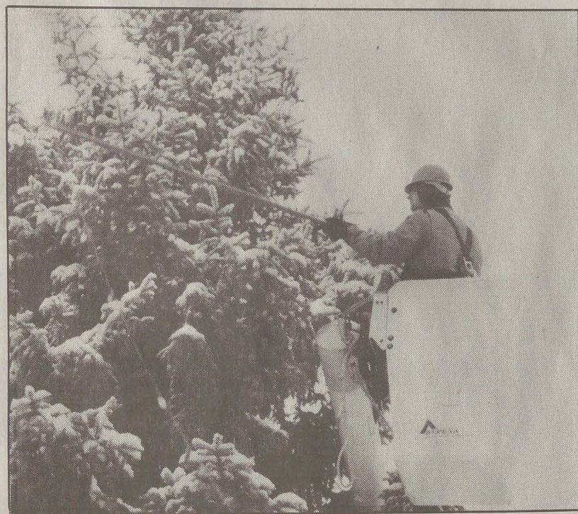
This Utility Tech student hung 750 lights on the Christmas tree near the entrance to Besser Technical Center.