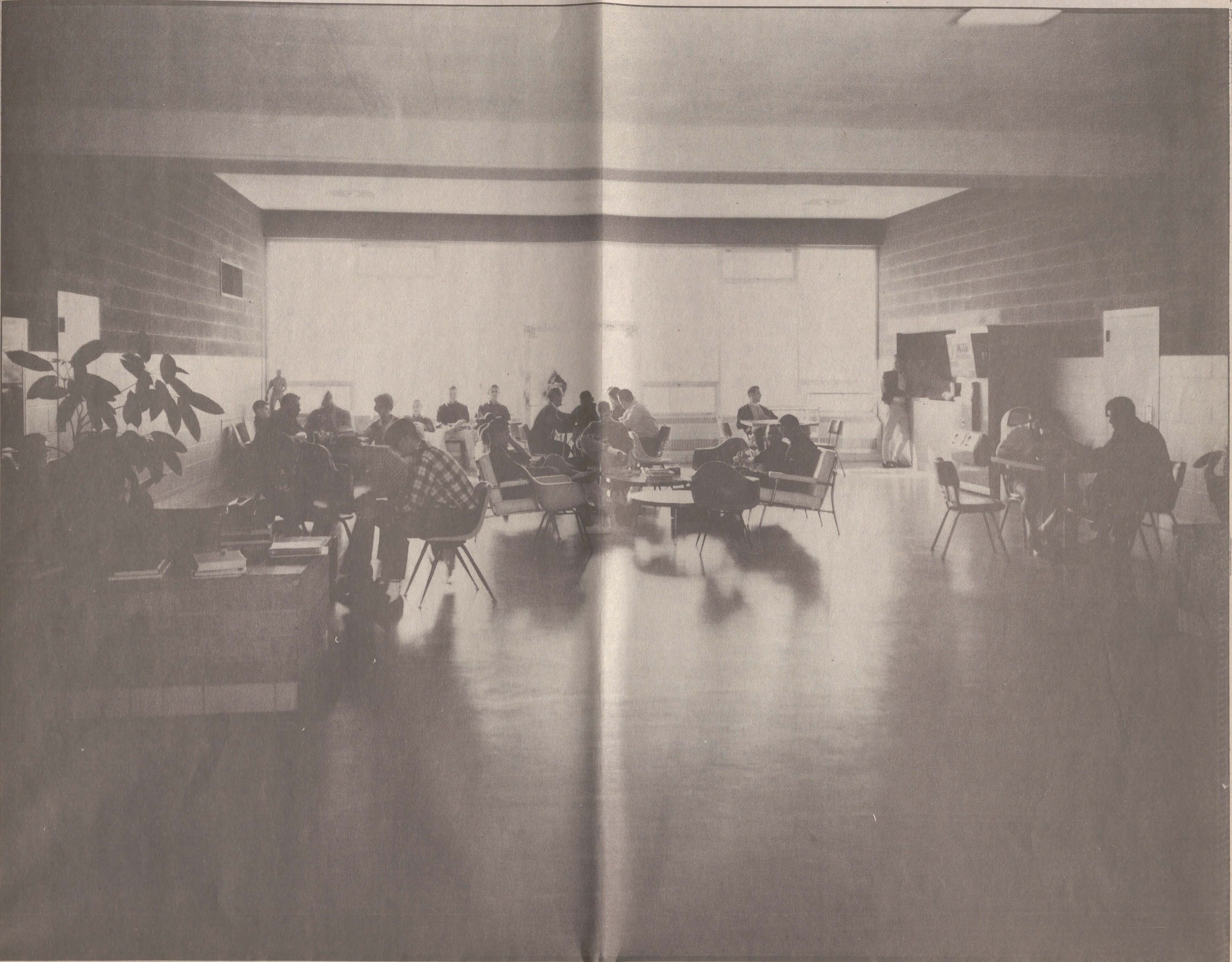
Van Lare Hall's student lounge from 1964. In the past 3 decades, the lounge has seen many changes: plush carpets, comfortable padded chairs, study tables, a T.V. system, lockers, and a pop machine. While the new lounge is currently relaxing and enjoyable, do you think we could have the milk vending machines back? Please?