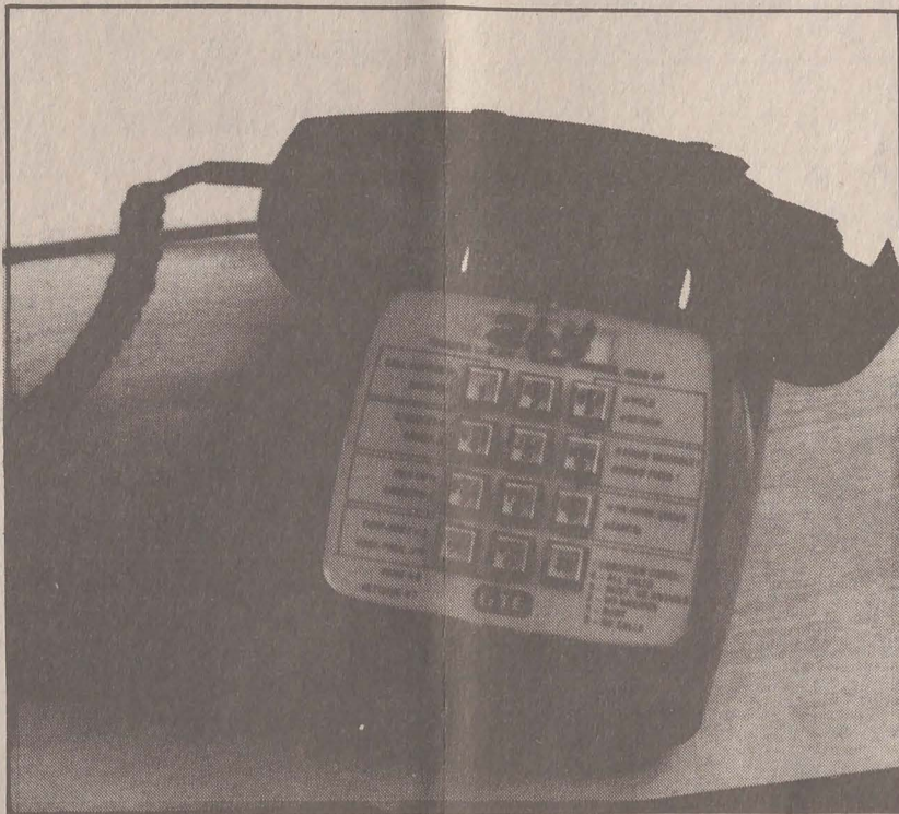
Presenting the GTD 120! As you can see from this current photo, the phone system installed by GTE in 1980, is still in use.

■ a "call park" so someone talking on one line is alerted by a "beep" that someone is