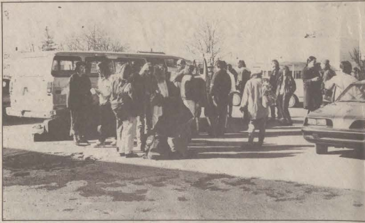
Approximately fifty art students assembled to begin their journey to Chicago.