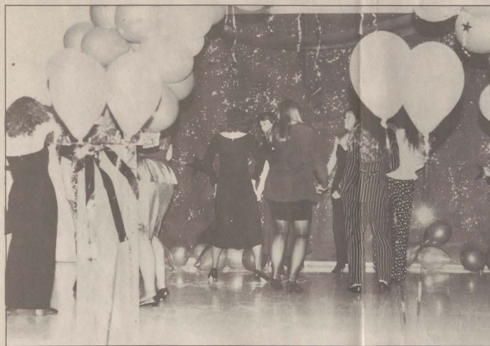
Students danced it up during Homecoming at the Alpena Civic Center on February 5. Student Senate planned and hosted the event, which was free to students.