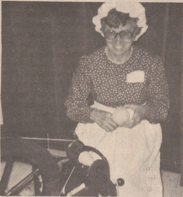
Spinning was one of the historical arts shown on Pioneer Day.