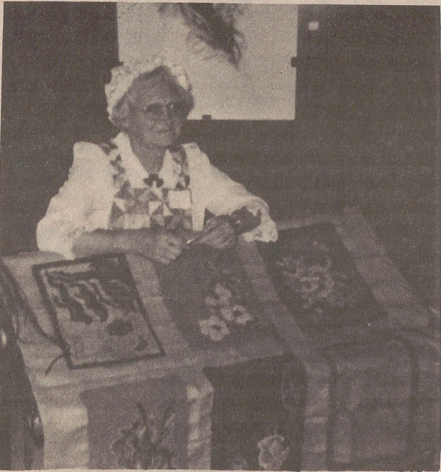
Needlepoint work was demonstrated on Pioneer Day.