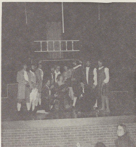
The Cyrano Crew from A.C.C.