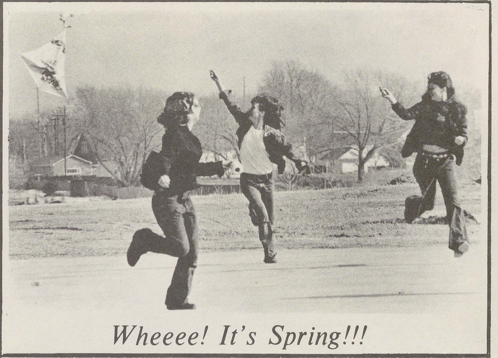
Wheeee! It's Spring!!!