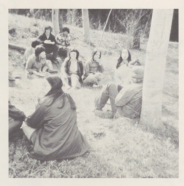
Bring on the 12th course!