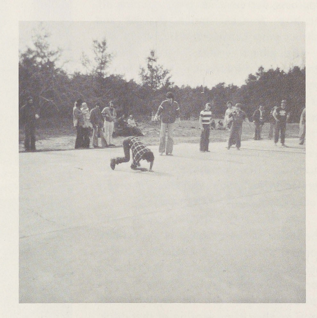
I think I missed.