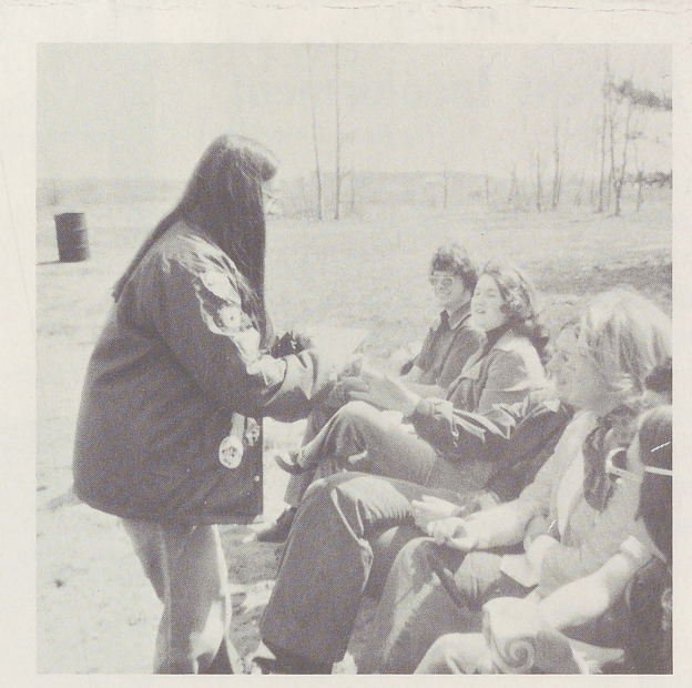
One for you & two for me.