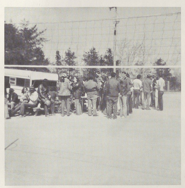
Free beer for everyone.