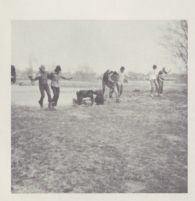
I've been tied to better things.