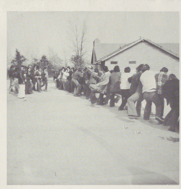
All hands on deck...