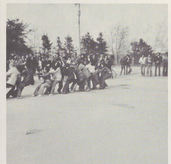
Call in the reserves.