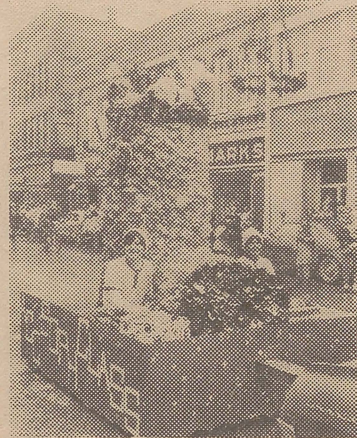
SOPHOMORE CLASS FLOAT

the Alpena Civic Orchestra. The Orchestra will consist of 10 members, forming a small chamber orchestra. The main selection will be J.S. Bach's Cantata #142, "For Us A Child Is Born."