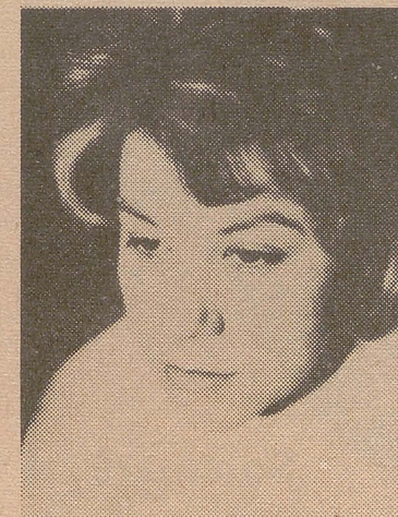
MRS. TITUS -

The temporary site for the hatchery is located on Long Rapids Road and is situated on what used to be part of Oxbow Farms, now owned by Tom and Ralph Fletcher. The Fletcher brothers have made this property accessible to A.C.C., at a nominal (Continued on Page 4)