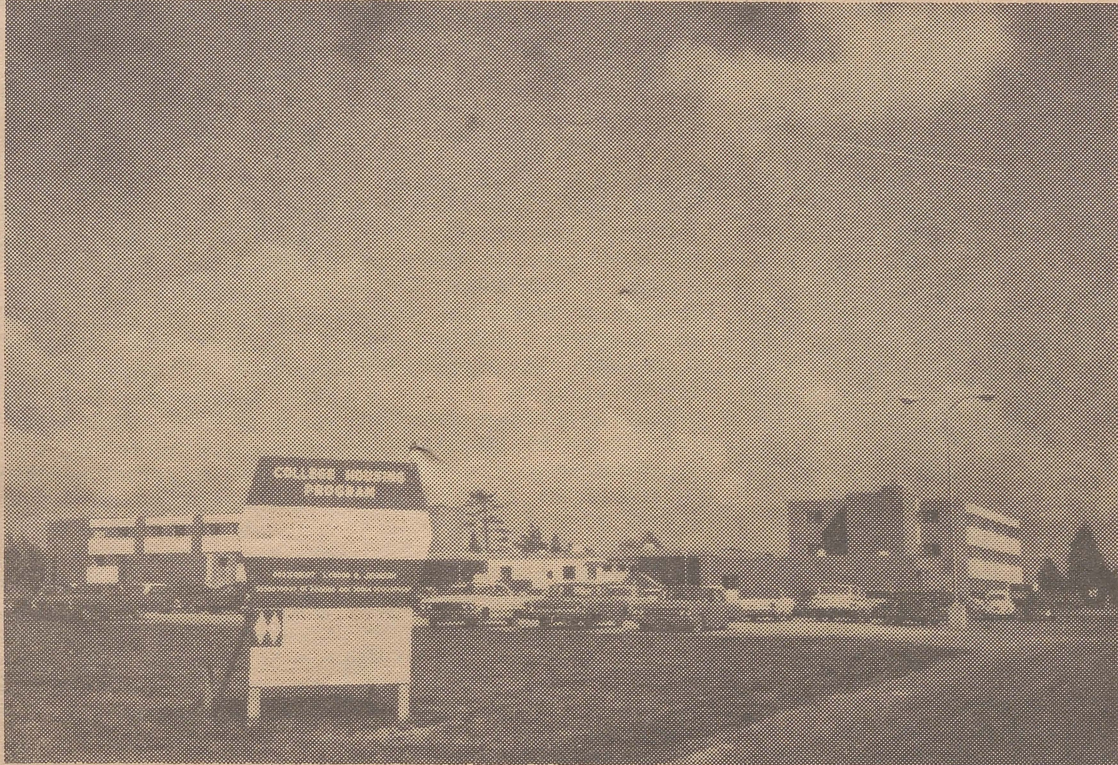
ALPENA COMMUNITY COLLEGE DORMITORY

Alpena Community College has opened its first Student dormitory, on its seventy-five acre campus on Besser Lake. Two-hundred forty students; One hundred twenty co-eds and One hundred twenty men can be accommodated