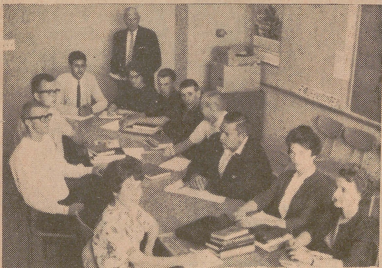
CREATIVE WORD CLASS