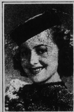
Olivia de Havilland

Gold Is Where You Find It. (First National). Directed by Michael Cur- tiz. Cast: George Brent, Olivia de Havilland, Claude Rains, Margaret Lindsay. The con- flict between hy- draulic mining and wheat farm- ing following the gold rush of 1849, is the theme of this historical ro- mance putting forth some of the principles of so- cial justice. The film, in technicolor, is highly recom- mended for family showing.