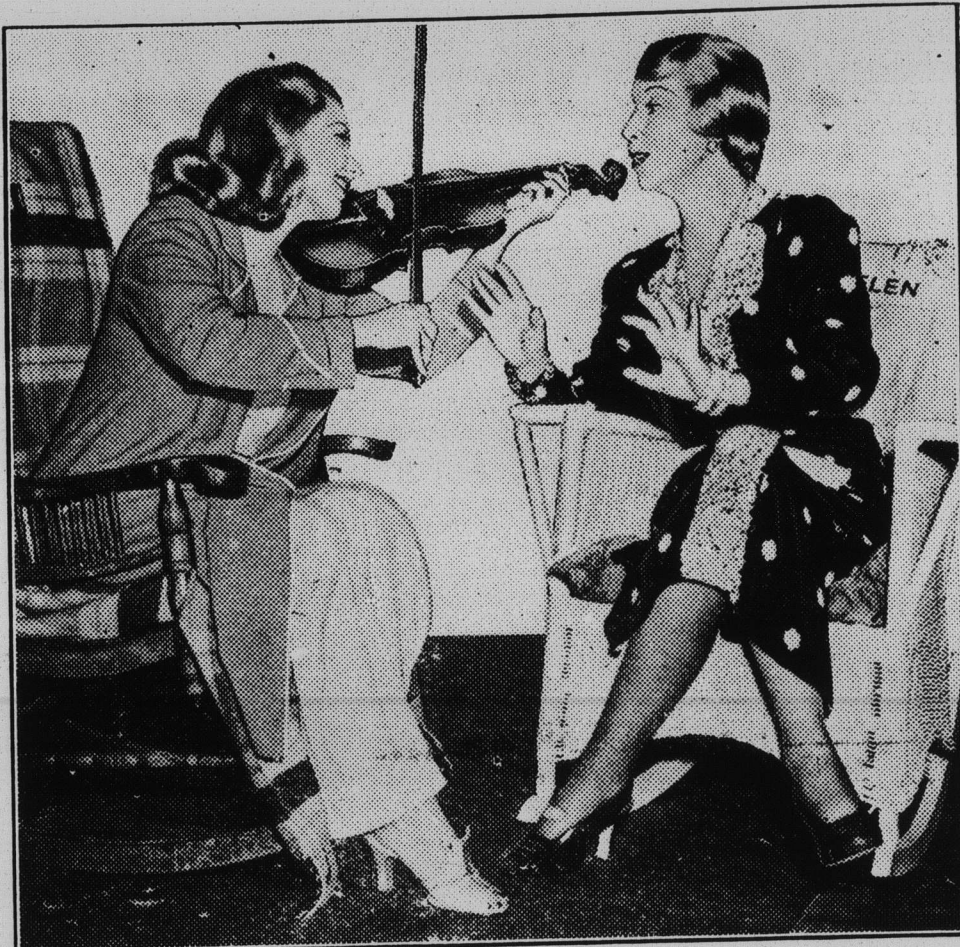
While Ann Sothorn tears off a violin solo between scenes of "She's Got Everything" in which Gene Raymond is co-starred, Helen Broderick seems to be inflamed with admiration, or something. Miss Broderick and Victor Moore play featured roles.