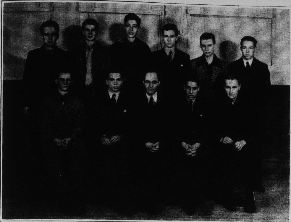
New Trier High school's debate teams, which are leading the local forensic leagues, are shown in this picture taken for the "Echoes" annual publication of the senior class.