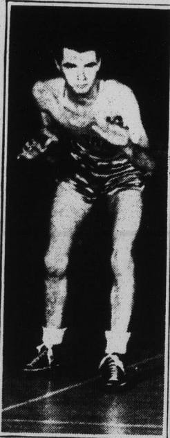
Lehle Photo Bud Carey

New Trier has had some state champion table tennis players pass through its portals in its time. Why? because of the superb training they got at school the competition that