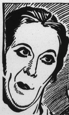
Edna May Oliver

Edna May Oliver and James Gleason again team to solve a thrilling murder mystery, and endow their sleuthing with laugh - provoking repartee in "Murder on the Blackboard," showing at the Wilmette theater Sunday and Monday, August 26 and 27. This film is a worthy sequel to "The Penguin Pool Murder," in which they made their first characterizations as Hildegard Withers and Oscar Piper. Again Hildegard and Oscar tackle the solution of a baffling crime.