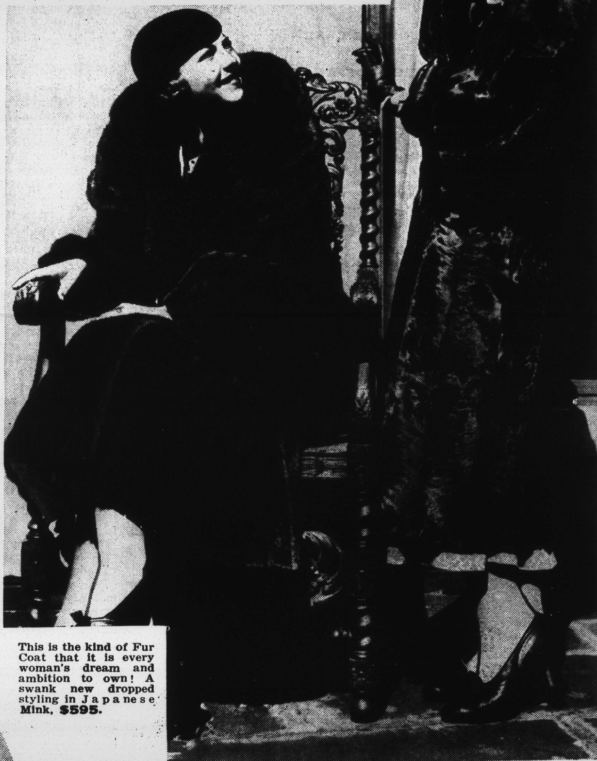
This is the kind of Fur Coat that it is every woman's dream and ambition to own! A swank new dropped styling in Japanese Mink, $595.

At BISHOP'S you need never spend more than you can afford. For seventy-four years prices have been fair and quality of the highest. You can buy here with the utmost confidence.