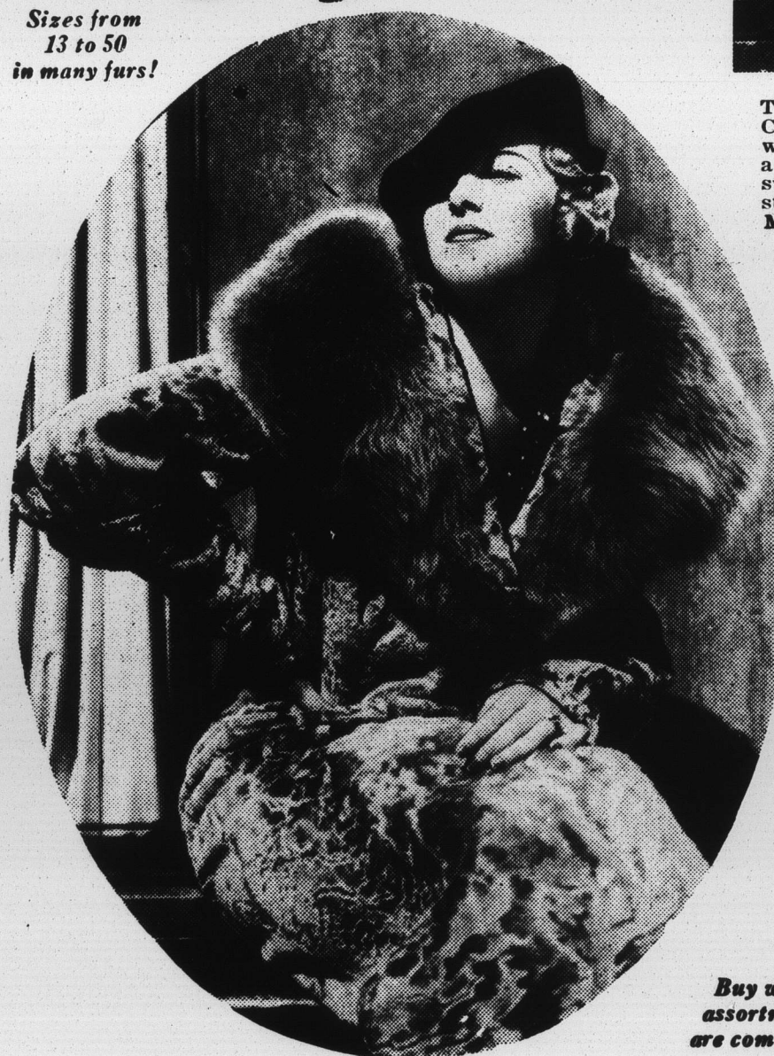
The dressy all-purpose coat is discovered at its very best in this pearl-gray Lustre Lamb coat. Trimmed in platinum dyed white fox. It is luxury and comfort wrapped into one. Its price is a modest . . . $175